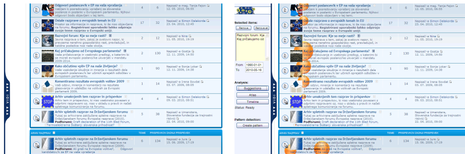
(a) Initial, hidden state. (Note the left margin.)

When a user first visits a VIDI-supported forum, the toolbar is discreetly hidden in the left margin of the page (Figure 1(a)) unless the user has used the toolbar on her previous visit. If the user clicks on the blue handle, the toolbar expands (Figure 1(b)).